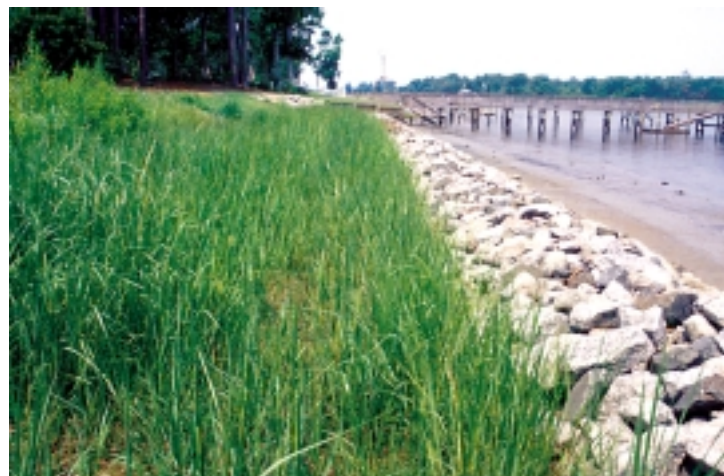
Same shoreline after regrading of eroding banks and stabilization with stone sill.