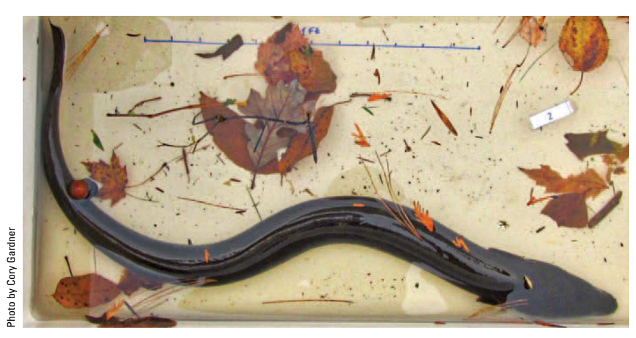
Researchers from the University of Maine have been tagging eels such as this two-foot long one to learn more about their migration.

many are leaving, and when, there might be implications for management." For example, if scientists find that most of the eels leave on a few nights with certain conditions (rain, high-flowing rivers, new-moon darkness), managers can shut down hydroelectric turbines on those nights to spare the eels.