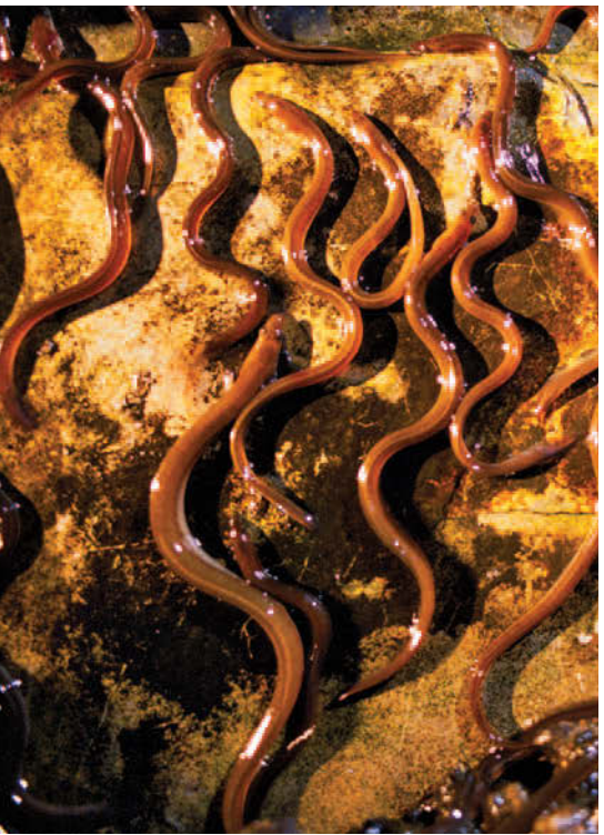
Migrating ever upward, mostly at night, adolescent eels can even climb dam walls.

While spawning activity remains undocumented, larval eels appear in the ocean currents in and around the Sargasso. After making a genetic note about how to get back someday, baby eels ride the Gulf Stream north.