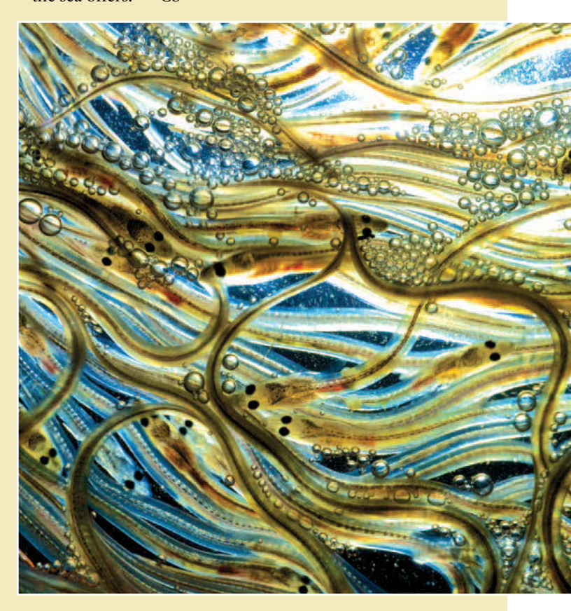
These glass eels have been harvested and are awaiting transport to Asia, where they will be grown to market size. They were photographed in an eel buyer's holding facility in Woolwich, Maine.

Despite elvers being a relatively "new" fishery in Maine (since the 1970s), there is something fitting about seeing nets in the rivers, and watching men and women work the midnight shores by lantern-light, making a living from what the sea offers. —CS